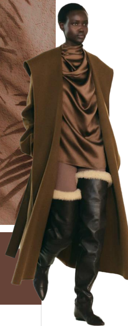
PANTONE 19-1235 TCX Brunette