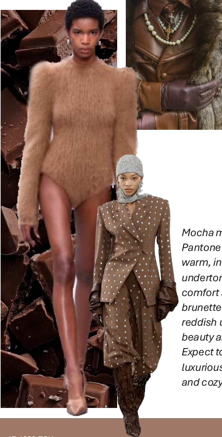
PANTONE 17-1230 TCX Mocha Mousse

Mocha mousse dominating as Pantone's color of the year with its warm, inviting brown and creamy undertone, offering a sense of comfort and indulgence. While brunette lends a richness with reddish undertones, evoking natural beauty and grounded sophistication. Expect to see these colors in luxurious fabrics like suede, leather, and cozy knits.